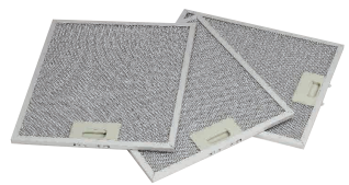
Mesh filter option included