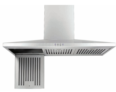
Filter hinge safety system